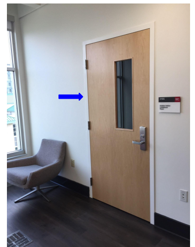
Again, if you are running late, while it is ok to use the main entrance shown by the red arrow, you will be entering very close to the speaker. There is a second entrance around the corner from the room, near the window, as shown in these pictures (blue arrow). Hopefully all of the attendees have taken a seat so they are not blocking this entrance.